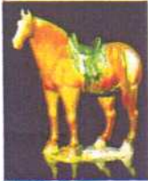
Galerie Eric Pouillon Impressionnant cheval de Perghana Chine - Dynastie des Tang (618-906). Terre cuite émaillée trois couleurs. H. 75 cm