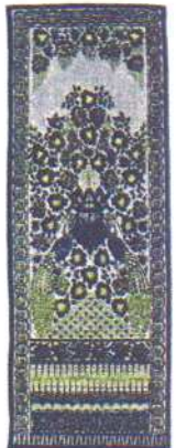
Galerie Chevalier. Une part of a pair of Aubusson tapestries (Braguette Warstrops). H. 4.15 x L. 1.55 m.