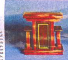
Galerie Alain Michelovici André SORNAY Buffet bar which transforms into a gaming table 4 "solitaires", 4 drawers, 2 fitted trays This bar serves and waiters server with steel table, solid walnut