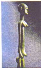
Bernard Dulon. - Statue plus dite débite de la société mystique du pays Mali - XIXe siècle - H. 80 cm

including Louis XV, his minister Machault d'Arnouville, Madame de Pompadour and Marie-Antoinette. Vauclair Gallery has chosen a selection of monumental faïence fine pieces with pâte sur pâte decoration of the type shown at the Paris Exposition Universelles of the second half of the nineteenth century. Gallery Chevalier's display will concentrate on sets of tapestries woven at the French Royal factories, the Gobelins, Aubusson and Beauvais, from the sixteenth to the twentieth centuries, including L'Entrefenêtre du Printemps , from the Enfants Jardiniers series by Charles Le Brun, Episode de la guerre de Troie after Isaac Moillon, who was peintre du Roi at Aubusson, and a pair of Art Déco portières by Emile Gaudissart.