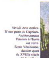
Viviani Arte Antica. D'une partie de Capriques . Architecturales Peinture à l'huile sur verre. Écrité Vénetienne, dernier quart du XVIIIe siècle 76,5 x 60 cm