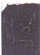
Galerie Fabien Bonakia. Jean DUBUFFET (1901-1985) Petit arpent , 1942 - Oil on canvas. 130 x 97 cm