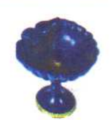
A la façon de Venise. Coeque en lapis lazuli en forme de coquille en pâte de verre et monture en argent et cuivre doré. XVIIe siècle.

including Louis XV, his minister Machault d'Arnouville, Madame de Pompadour and Marie-Antoinette. Vauclair Gallery has chosen a selection of monumental faïence fine pieces with pâte sur pâte decoration of the type shown at the Paris Exposition Universelles of the second half of the nineteenth century. Gallery Chevalier's display will concentrate on sets of tapestries woven at the French Royal factories, the Gobelins, Aubusson and Beauvais, from the sixteenth to the twentieth centuries, including L'Entrefenêtre du Printemps , from the Enfants Jardiniers series by Charles Le Brun, Episode de la guerre de Troie after Isaac Moillon, who was peintre du Roi at Aubusson, and a pair of Art Déco portières by Emile Gaudissart.