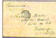
Roumer S.A. - 1er Janvier 1849 1er Jour d'utilisation du Timbre-Poste en France - Guerre de 1870 - Bulletin "Le Nippon". Lettre adressée par le premier Ballon Monté sorti de Paris pendant le Siège. Une des seules pièces créées pendant le siège cachet rouge de la Compagnie des Aérostats.